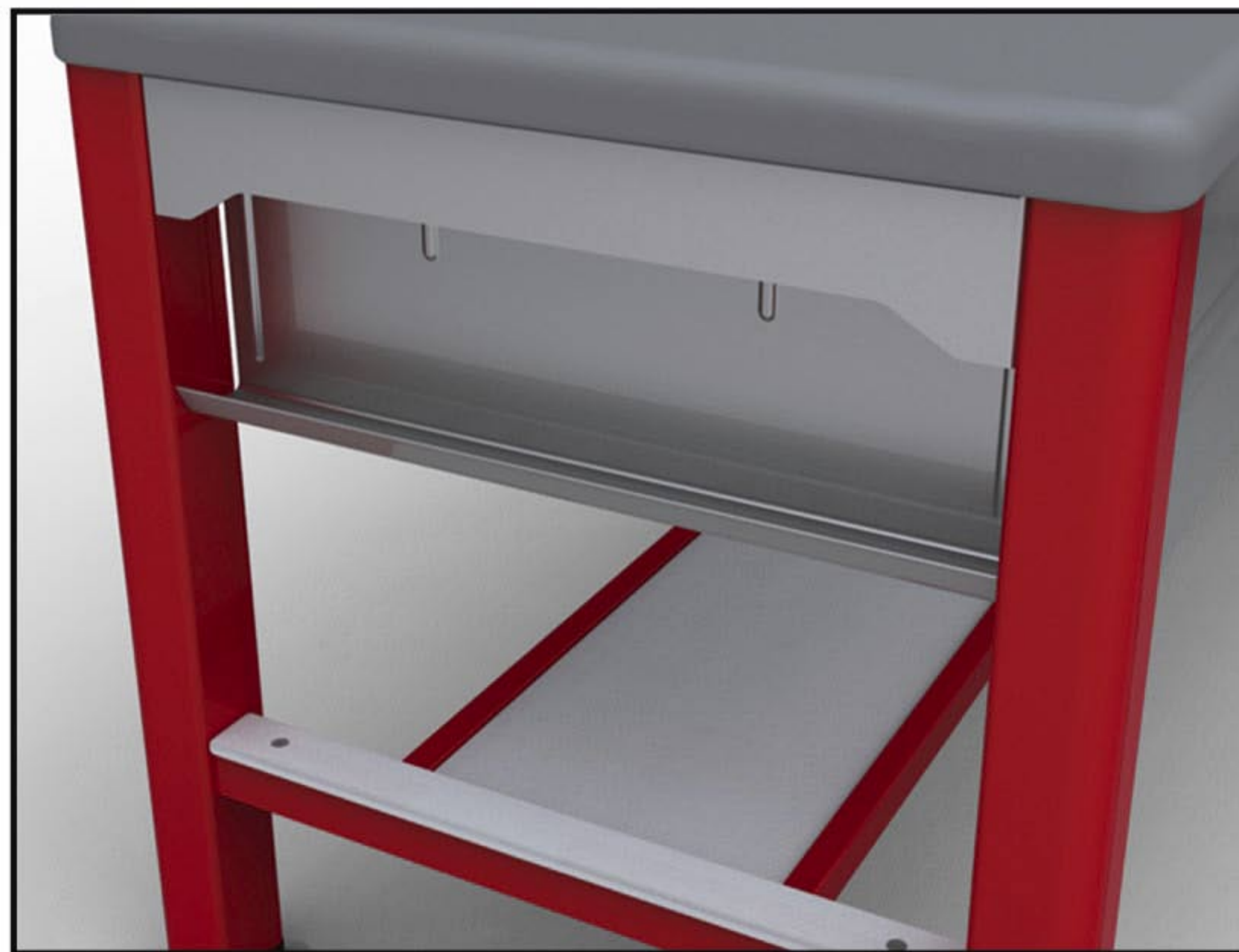
Tape Shelf and Custom Logos